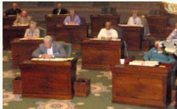
Bottom: MEAAA's Silver Haired Legislature delegation meets with the state's other nine SHL delegations each October in Jefferson City to debate and vote on bills they will support in the next legislative session.